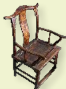
a Chinese chair /tʃ/