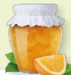
orange jam /dʒ/