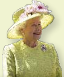
a green queen /iː/