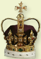
a brown crown /aʊ/