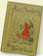
a good book /ʊ/