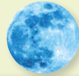
a blue moon /uː/