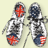
English shoes /ʃ/