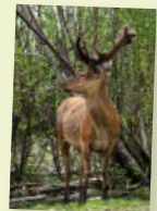
a severe deer /ɪə/