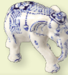
a delicate elephant /ə/