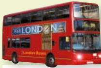
a funny bus /ʌ/