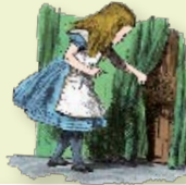
a small door /ɔː/