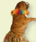
an odd bulldog /ɒ/