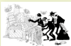
three thieves /θ/