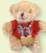
a rare teddy bear /eə/