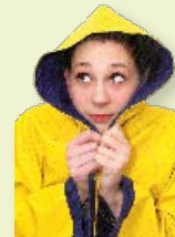
a yellow raincoat /əʊ/