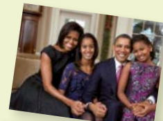
a worthy father /ð/