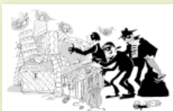
three thieves /θ/