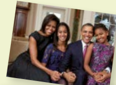
a worthy father /ð/