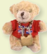
a rare teddy bear /eə/