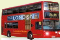
a funny bus /ʌ/