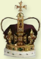
a brown crown /aʊ/