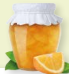
orange jam /dʒ/