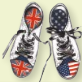
English shoes /ʃ/