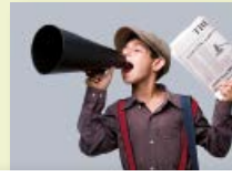
a noisy paperboy /ɔɪ/