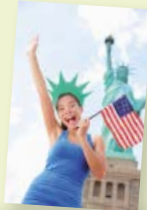
a pure tourist /ʊə/