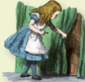
a small door /ɔː/