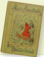
a good book /ʊ/