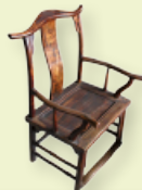
a Chinese chair /tʃ/