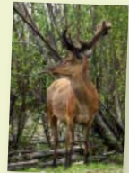
a severe deer /ɪə/