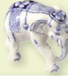
a delicate elephant /ə/