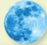
a blue moon /uː/