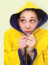
a yellow raincoat /əʊ/