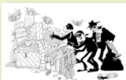
three thieves /θ/