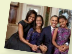
a worthy father /ð/