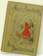
a good book /ʊ/